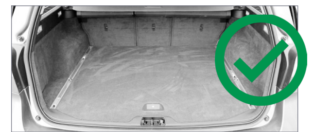
No threshold works for forklift loading.